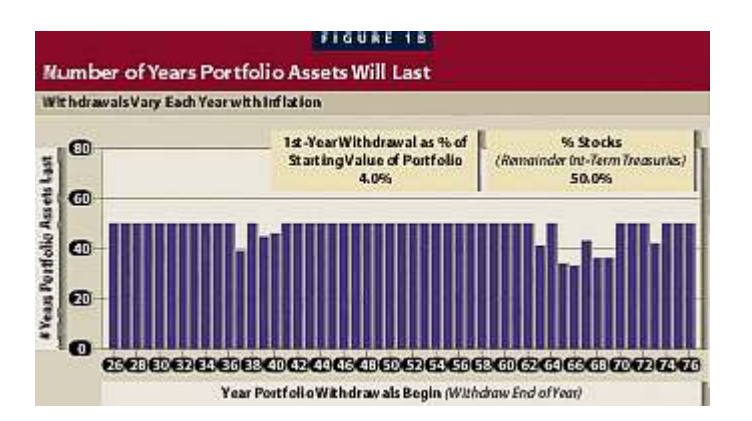
Figure I(A) (three-percent withdrawal rate) is as exciting as a crewcut. It shows that all clients, regardless of the year they began their retirement, were able to enjoy at least 50 years of inflation-adjusted withdrawals from their portfolios. The graphs become more interesting as we increase the percentage of first-year withdrawal. Figure I(B), featuring an initial withdrawal of four percent, begins to show the effects of some financial events. However, these effects are comparably mild; no client enjoys less than about 35 years before his retirement money is used up.

Beginning with Figure 1(C), at a five-percent level of initial withdrawal, these effects become much more pronounced. Clients beginning their